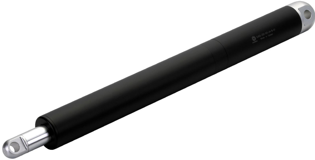
外形尺寸 APPEARANCE SIZE