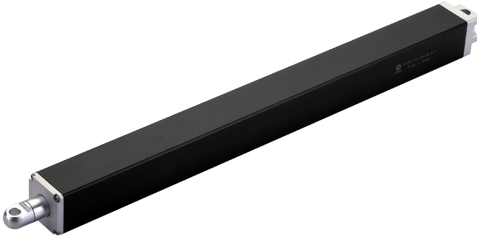
外形尺寸 APPEARANCE SIZE